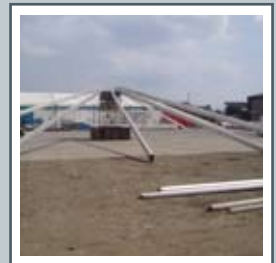
Example of Profiles and Loadings - Industrial Storage